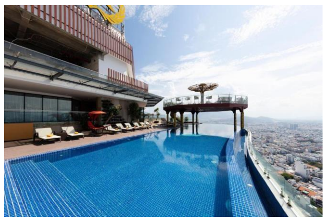
Gym Rooftop Lounge Pool